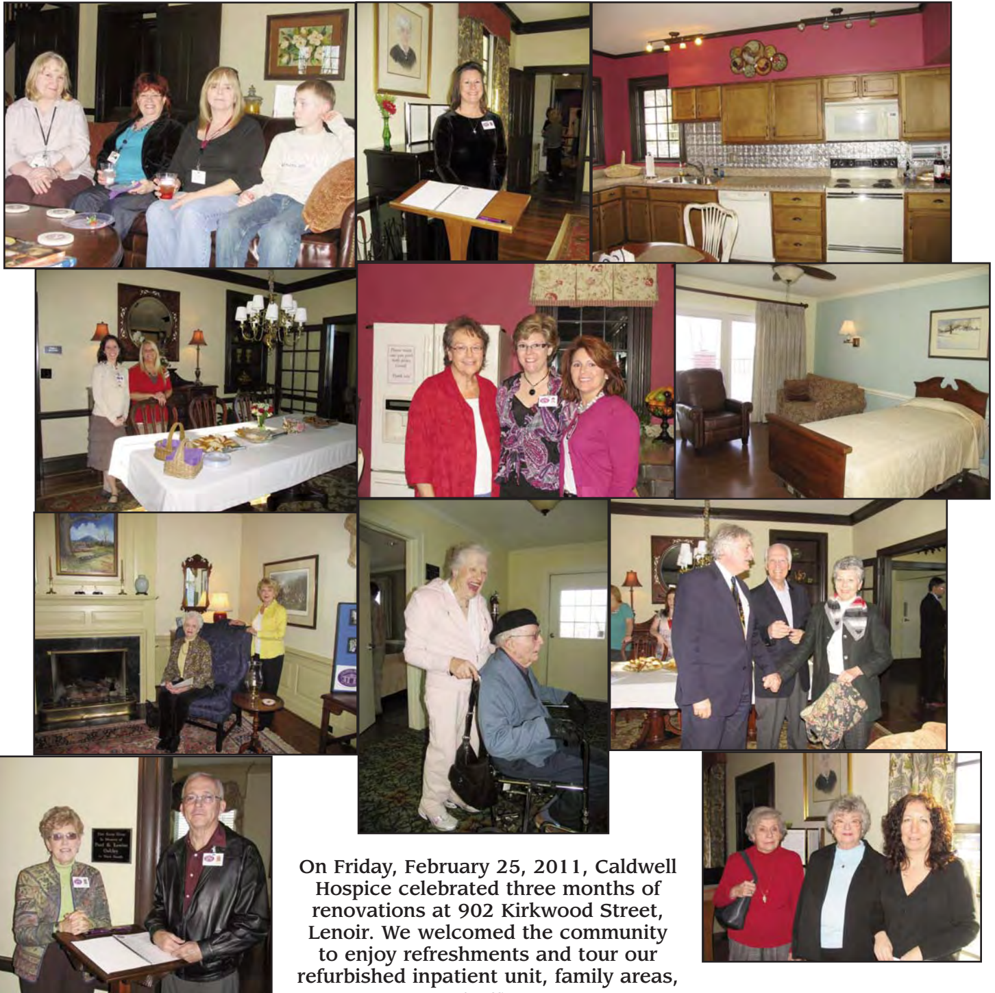
On Friday, February 25, 2011, Caldwell Hospice celebrated three months of renovations at 902 Kirkwood Street, Lenoir. We welcomed the community to enjoy refreshments and tour our refurbished inpatient unit, family areas, and offices.